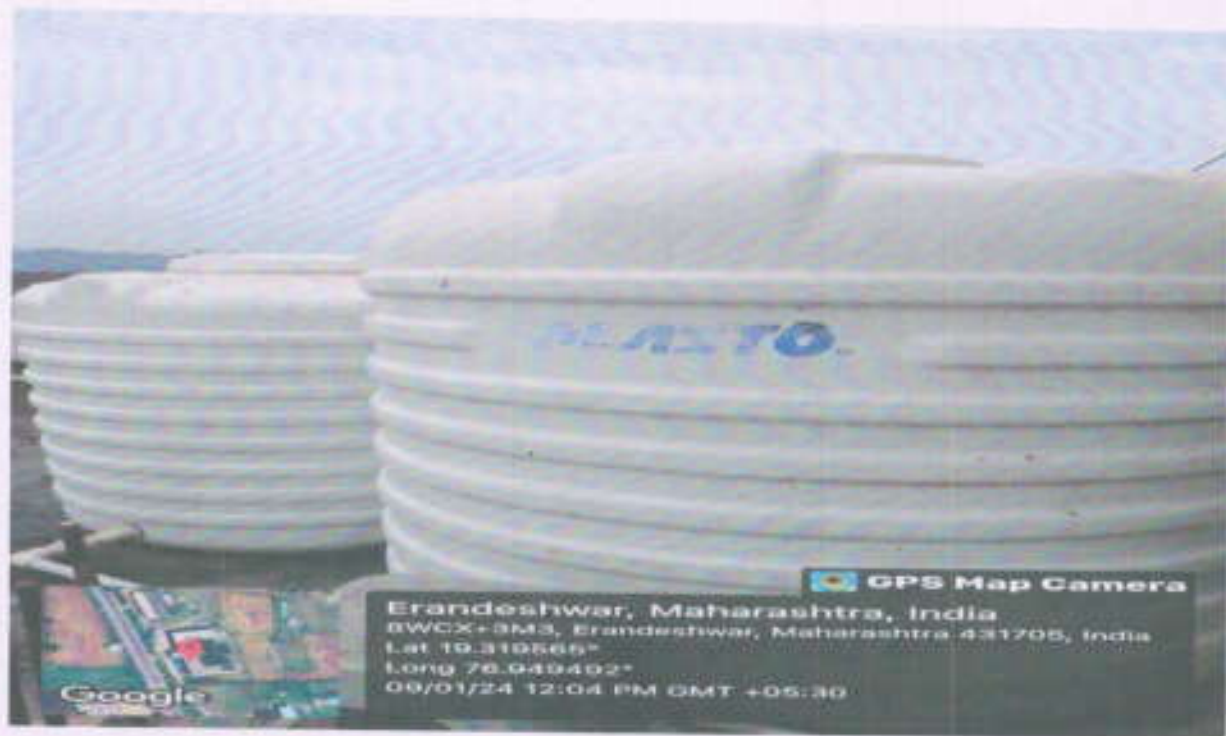
Water Harvesting tank (Capacity-1000L)