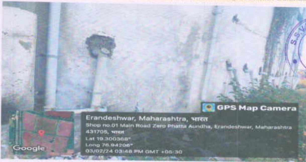
WATER HARVESTING CAMPUS