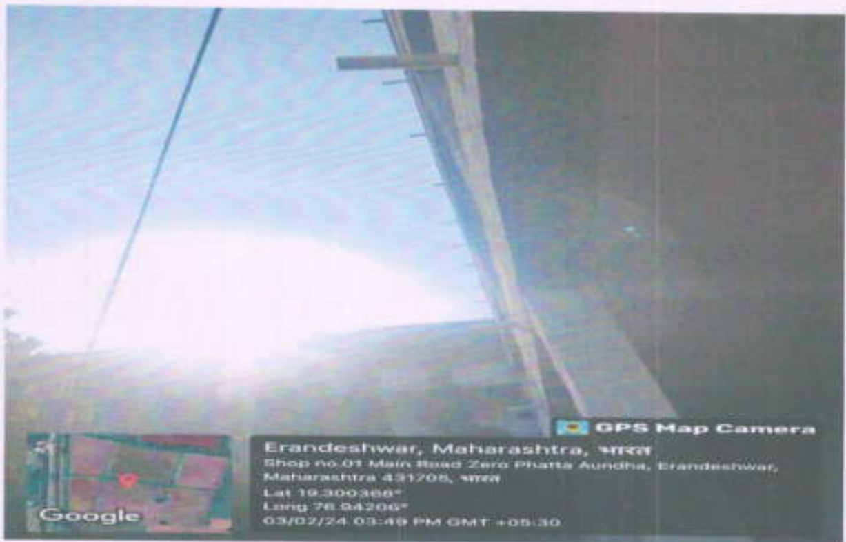
WATER HARVESTING CAMPUS