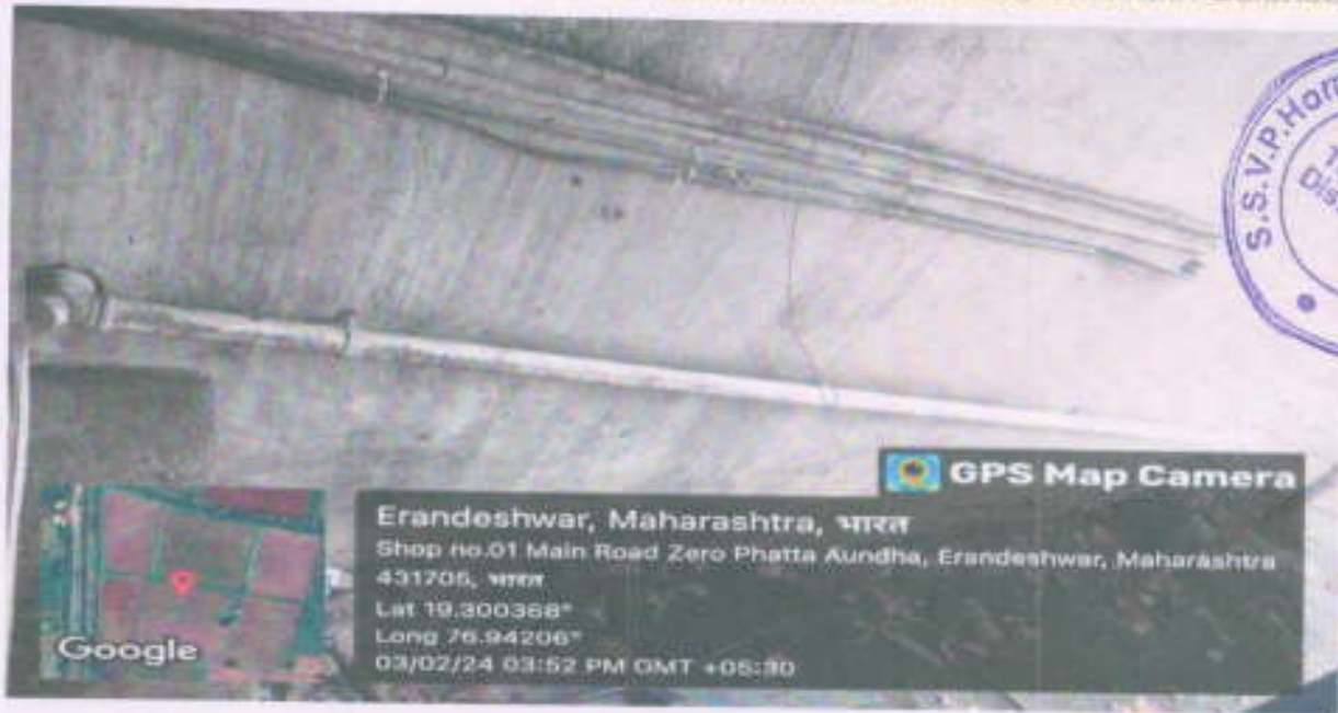
WATER HARVESTING CAMPUS